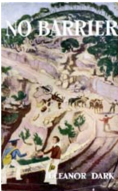
Part three in the famous timeless land trilogy... the discovery of a route over the Blue Mountains

Literary Map: summarise the most well-known Blue Mountains writers and plot the villages associated with them. Investigate the logistics of preparing the map itself and how it is to be distributed.