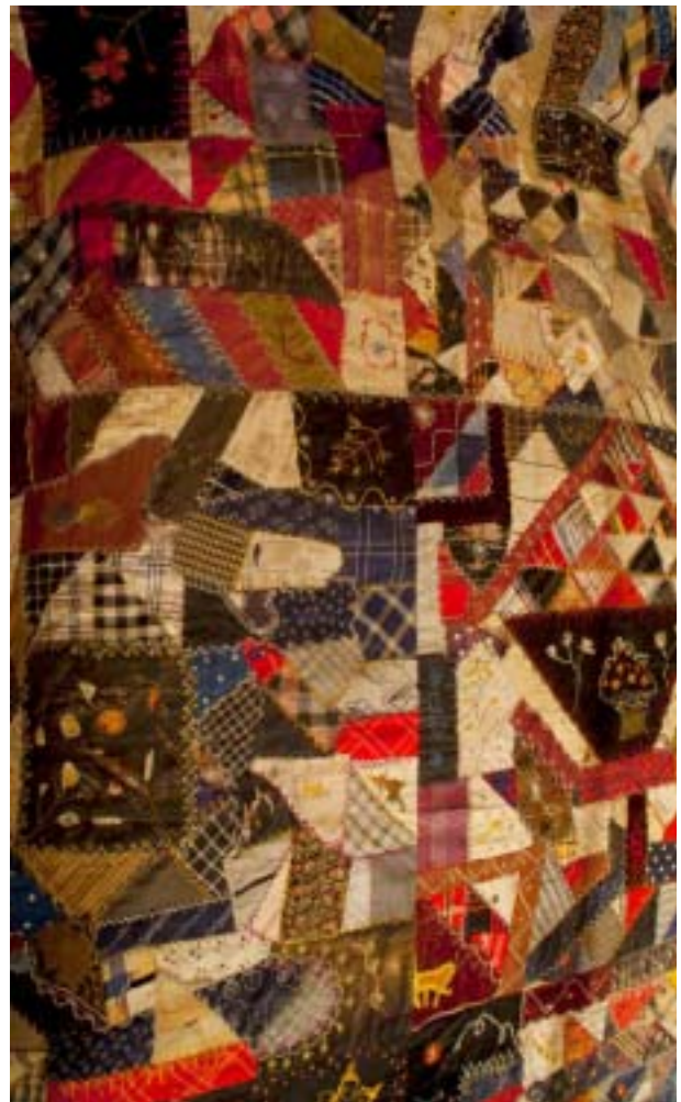
The Leake-Sutton quilt made in Pennsylvania, 1893

She carefully hoarded family memorabilia but was no homebody; having been the town's first postmistress during World War II, founded the Muzzle Loading Gun Club and been an active sportswoman and a bird watcher.