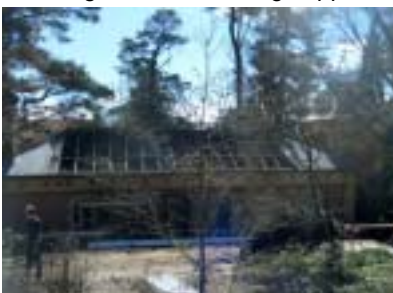
The project starts

An application to the Heritage Branch, NSW Department of Planning, for 50% funding support