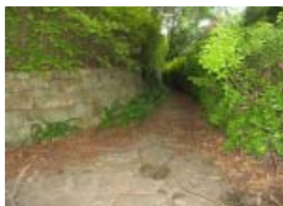
Lower garden path at Lidsdale House

On completion of building repairs a long term plan to resuscitate and restore the garden will be implemented. It seems right that a garden that grew out of the passion of a coal mine owner should now be restored by a coal mining company.