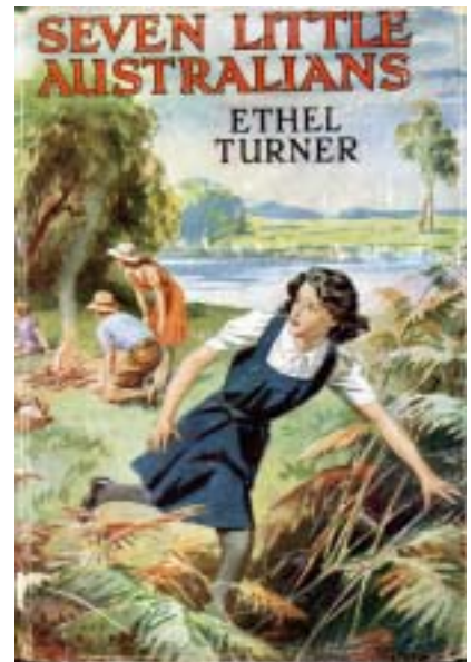
In Ethel Turner's Seven Little Australians 1 , Judy is sent to boarding school in Mt Victoria