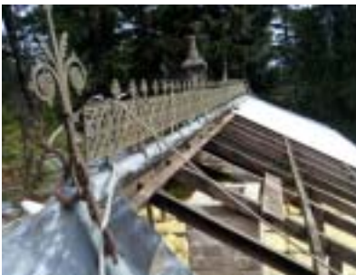
Original ridge capping folded back and iron cresting secured